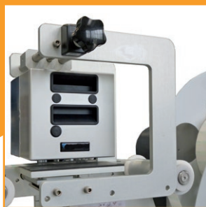
Thermal transfer printers

Two hybrid step-motors low-loss A++ Class Mechanical unwinder d. 400 mm Motorized rewinder d. 350 mm Stop photocell End of roll alarm Encoder in-put Touch Screen operator panel Offset and start delay adjustment Automatic recovery of missing label Applied label counter Setting memorization