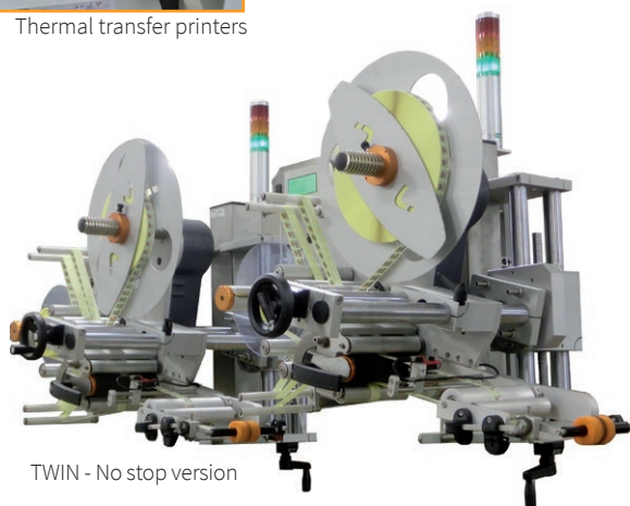
TWIN - No stop version